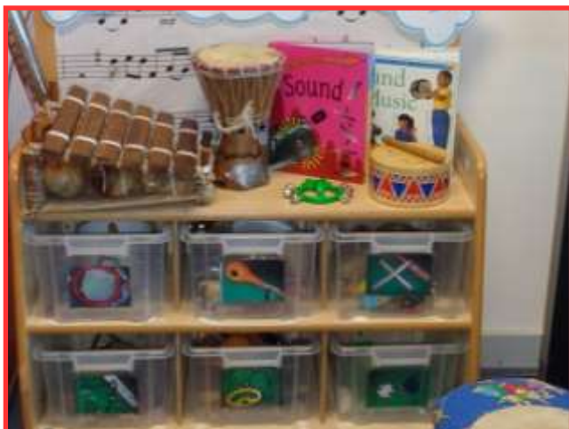
This is where you can make music.