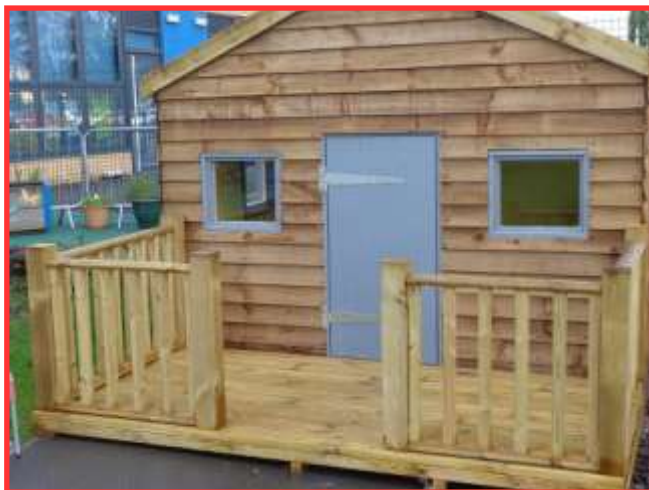
This is the play house.