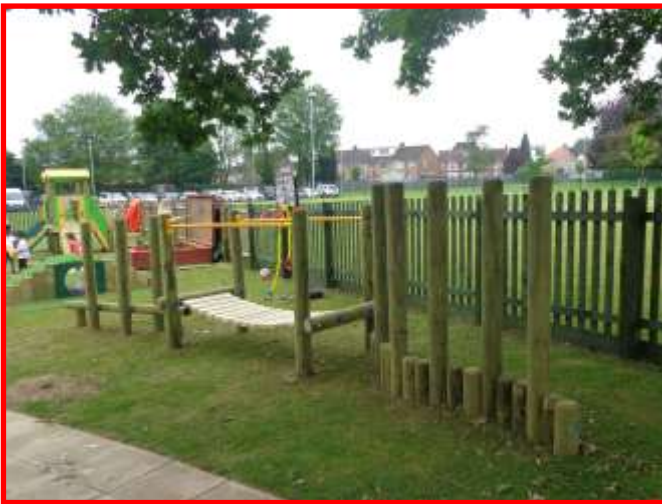
This is our outdoor equipment.

We can't wait to work in partnership with you.