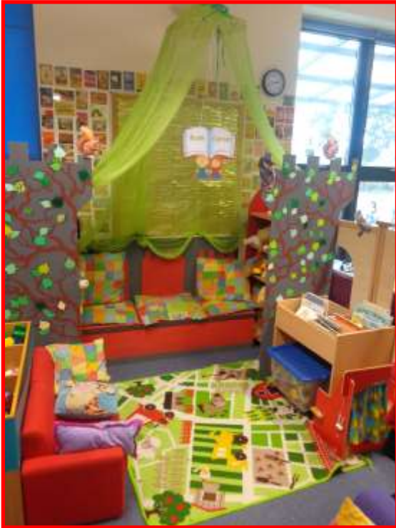
This is where you can relax with a book.