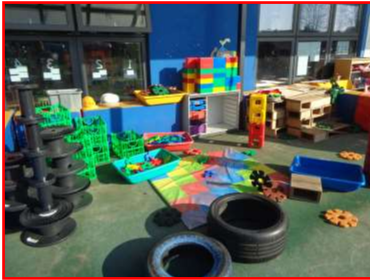
This is our outdoor construction area.