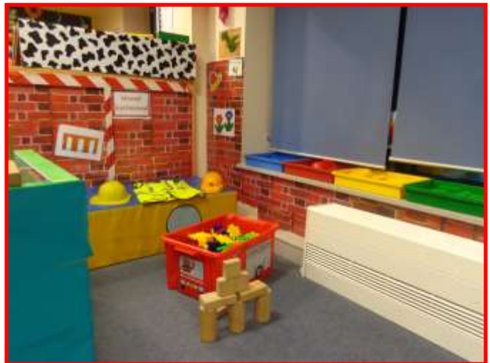
This is our construction area.