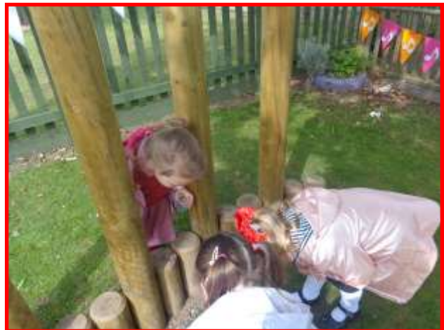
Here are some children learning in the outdoor classroom.