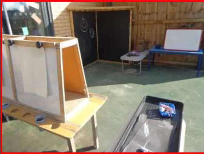
This is where we write outside.